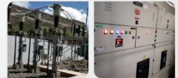
66KV Substation and Panels