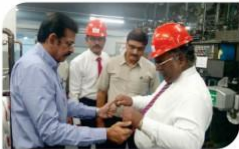
Our MD Site Visit to PT Asia Pacific Factory at Semarang, Indonesia