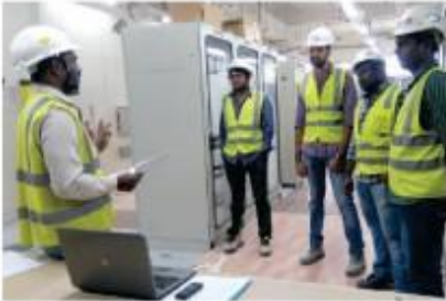
132/33kV Al Waab City Metro Substation