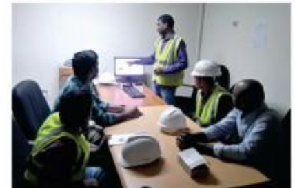
66/11kV Khalifa-2 Substation