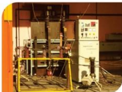
Basic short circuit test duty: T100s as per IEC 62271-100