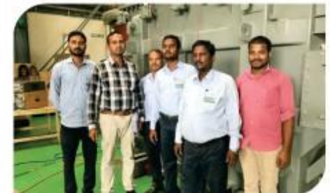
Successfully completed inspection of 10MVA Power Transformer, CESU