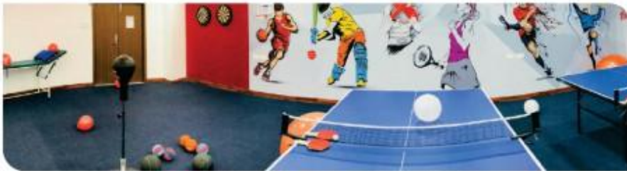
The facility is designed to resemble a premium recreation centre