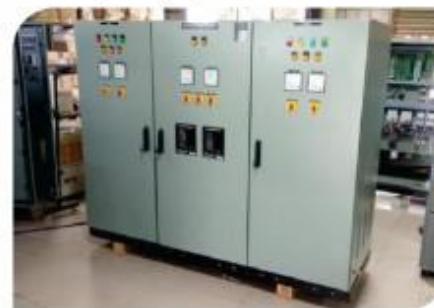
220V 80/80A Dual Float Cum Boost Chargers