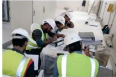
132/11kV Bu Garn Substation