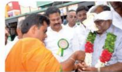
The MD being received in a traditional way,