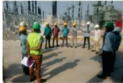
Safety Induction at HPL - Haldia