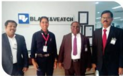
Our MD with M/s. Black & Veatch Team at Indonesia