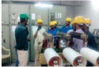
Safety Induction at HPL - Haldia