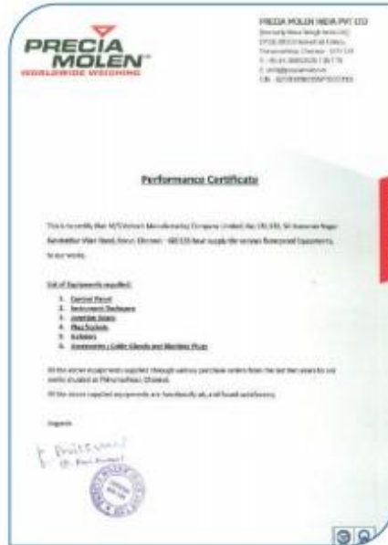
Performance Certificate from M/s. Precia Molen India Pvt. Ltd. for "Supply of Various FLP/WP Equipment".