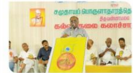
The MD addressing the sengunthar sangam