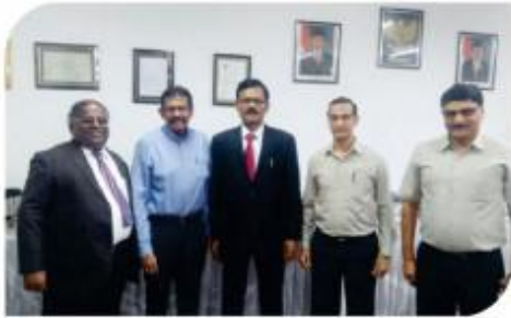
Our MD with PT Asia Pacific Team at Semarang, Indonesia