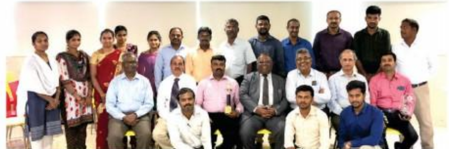
The MD with the jubilant VOMS team