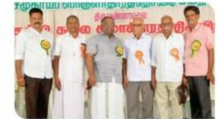
The MD with the Sangam leadership