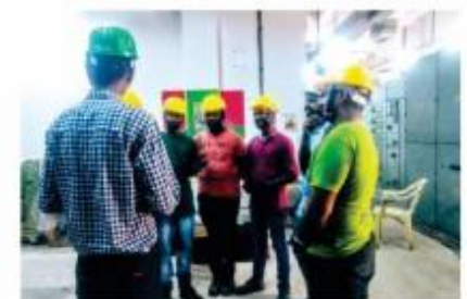
Safety Induction at HPL - Haldia