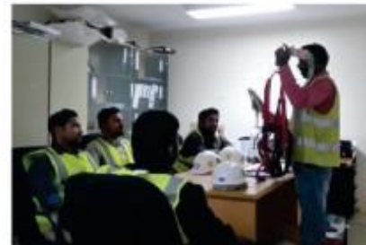
66/11kV Khalifa-2 Substation