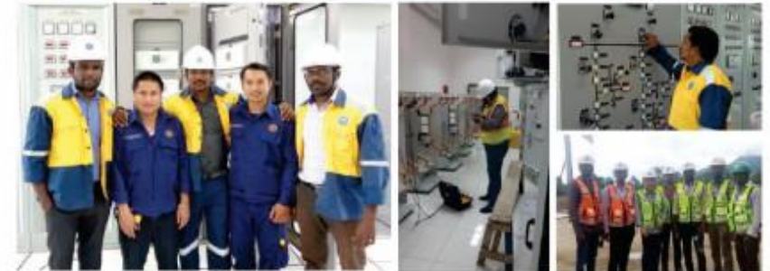
Group photos of engineers in various international sites