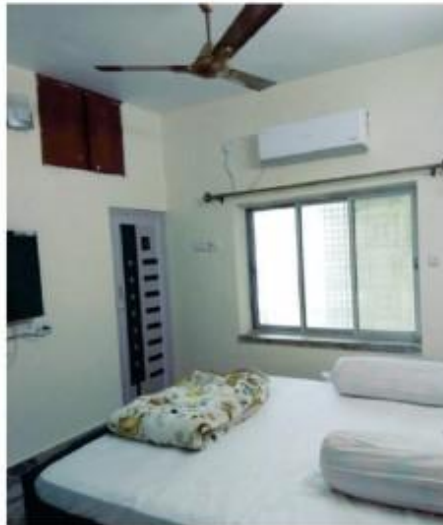
Inner view of our guesthouse