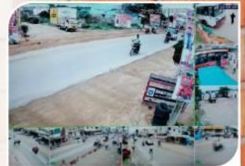
CCTV Monitoring Balaji Nagar Grama Panchayat, Secunderabad.