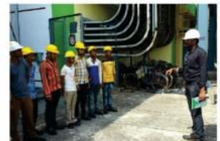
Safety Induction at HPL - Haldia