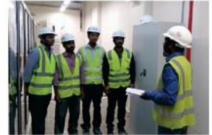
132/11kV Lusail Centre Metro S/S