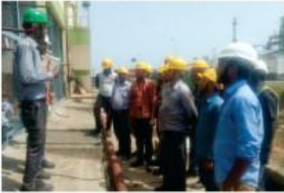
Safety Induction at HPL - Haldia