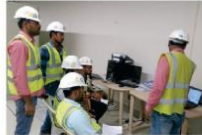
220/132/33kV Doha West Metro Super Substation