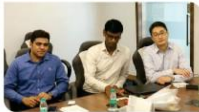
The UL team interacting with company representatives