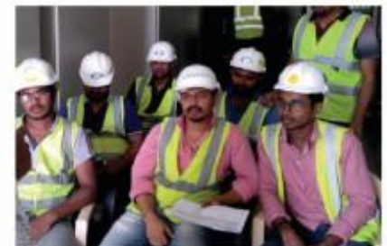
66/11kV Umm Al Seneem Substation