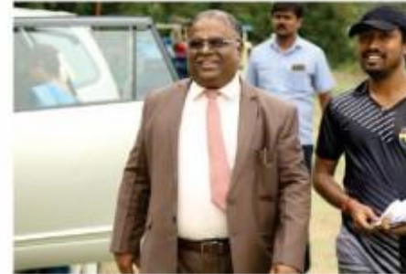
MD arriving at the stadium