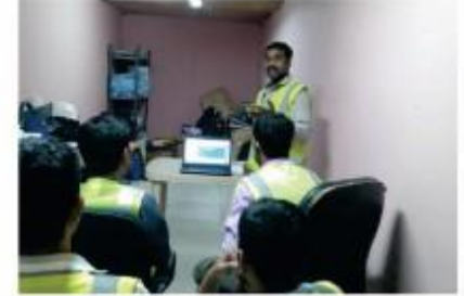
400/220/132/11kV Doha south super Substation