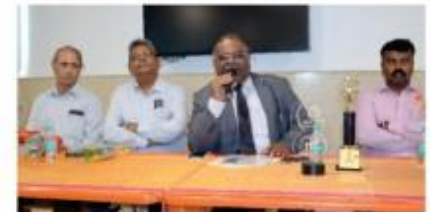
MD asking VOMS Employees to share their experiences