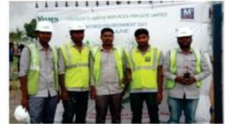
Amplus Solar Site