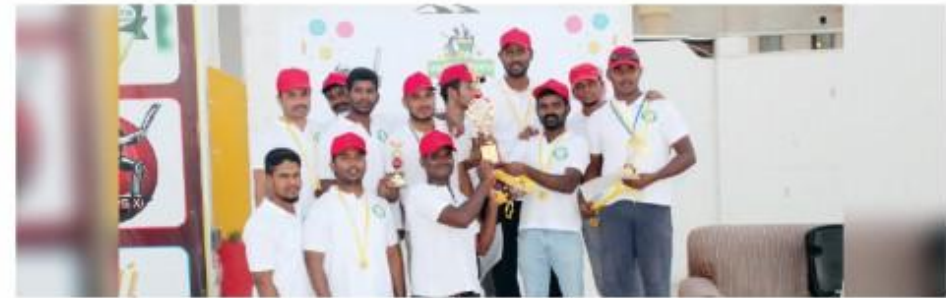
Winning team with the trophy