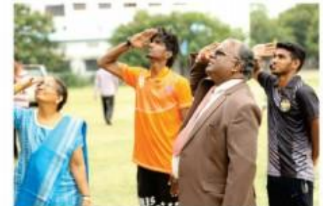
Saluting the National Flag