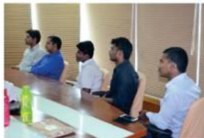
De-briefing after the presentation