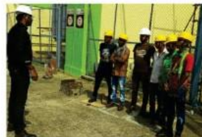
Safety Induction at HPL - Haldia