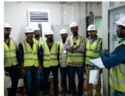
132/11kV Wakrah Logstlc-1 substation