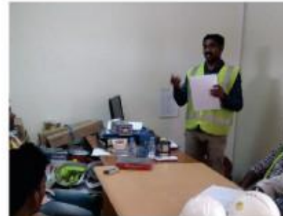
66/11kV Khalwat-2 Substation