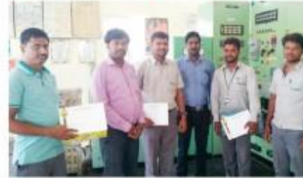
Green Intra Limited Site