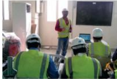
66/11kV Al Wakrah South Substation