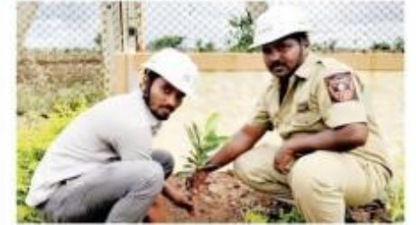
Green Intra Limited Site