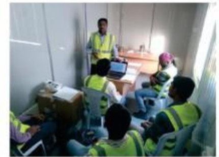
132/11kV RAS Abu Fonfas-3 Substation