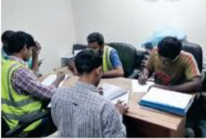
132/11kV Al Heedan Substation