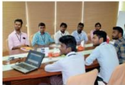
Engineers paying attention to the safety programme