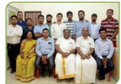
Group picture of MD with the Kolkata staff members