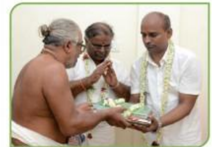
MD presenting the company books for blessing