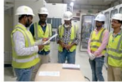
220/132/33kV Doha West Metro Super Substation