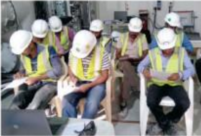
66/11kV Al Wakrah South Substation