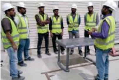
132/11kV Birkat Al Awamer-5 Substation