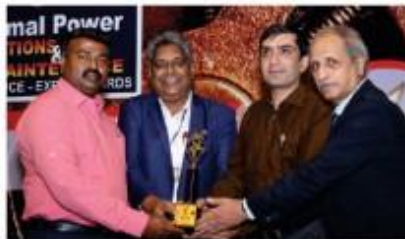
VOMS Leadership team receiving the award

The Mission Energy Foundation is an independent, non-profit Indian endeavour, established in 2008 to improve and promote the energy sector. Mission Energy Foundation is a micro-enterprise initiative that strives to spread knowledge in the globalising energy sector. They educate and spread technology awareness through ongoing contacts and discussions with the public and industry. The award is running into its 10th year, and has been lauded as a tremendous success throughout its run.