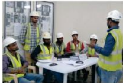
132/11kV Bu Garn Substation