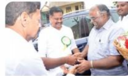
The MD being received at the venue