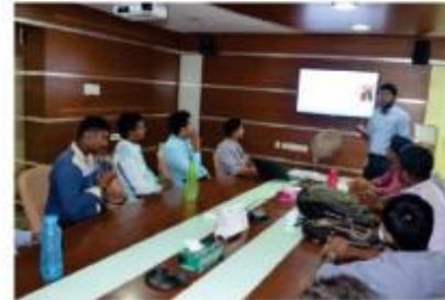
Safety Video presentation