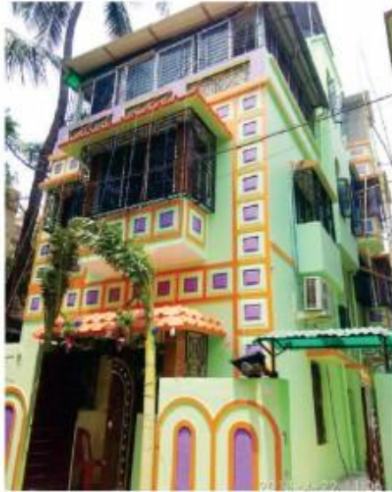
Outer view of our new branch office / guesthouse

Spread across three floors on a standalone building, the Guesthouse hosts Voltech's offices in its ground floor with three separate rooms, and a conference hall on the first floor. Two double occupancy rooms with complete furnishing and all electrical fittings and accessories are located in the same floor for senior executives and their families. The second floor provides accommodation for the Engineers. The terrace level houses the pantry and the dining hall for the employees. The building and its environs occupy a built-up area exceeding 7500 sq. ft.