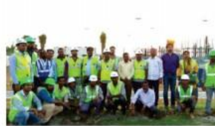
Amplus Solar Site