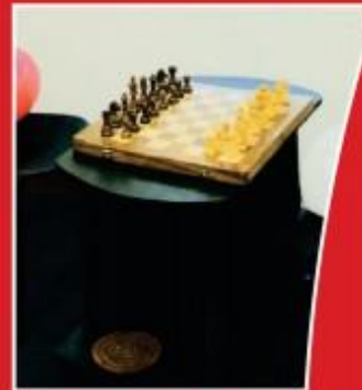
Wooden chess board with carved pieces