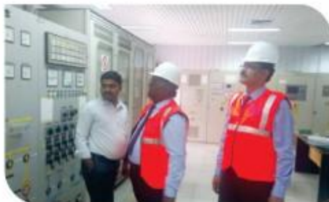
Our MD Site Visit to PT Asia Pacific Factory at Kawarang, Indonesia