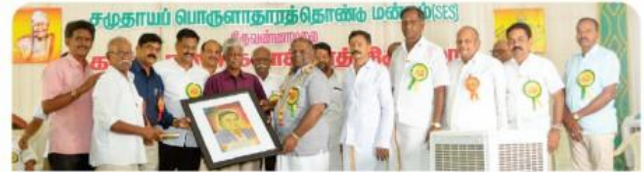
The MD receiving his portrait from the community elders