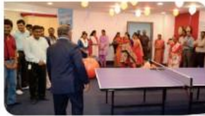
The MD inspecting the equipment on display