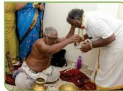
MD offering prayers during the inauguration

Addressing the staff and employees of the group, The Managing Director said that the Guest house would cater to the accommodation needs of the employees during their visit to Kolkata. He complimented the efforts of all who were involved in the project. Emphasizing the need for proper maintenance and upkeep, he called upon all employees and visitors to maintain the guest house in pristine order.