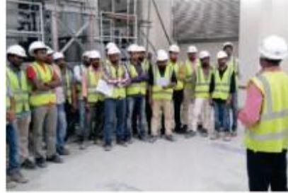
400/132/11kV Al Shakama Super Substation