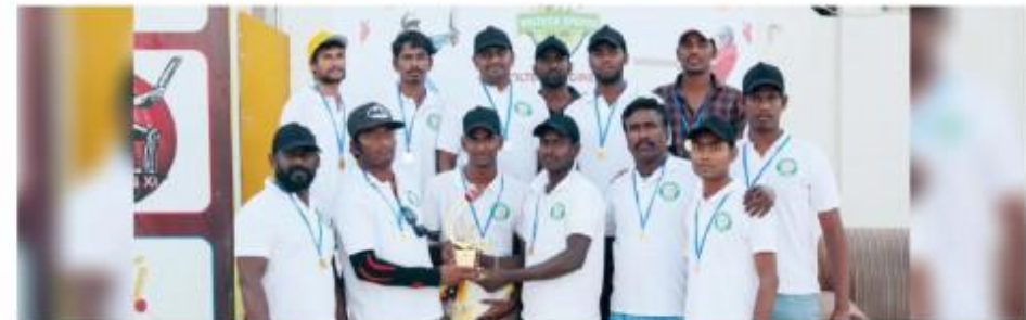
Runner team with the trophy