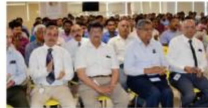
Gathering for the felicitation ceremony