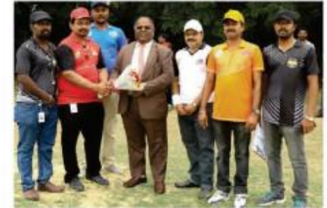
MD being received by the group captains