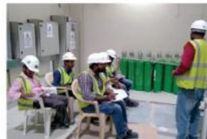
132/11kV Raf Abu Fanfas South Substation