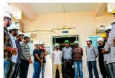
Safety Induction at HPL - Haldia