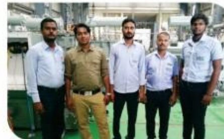
Successfully completed inspection for 1250KVA Transformer - TATA PROJECT