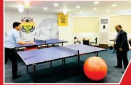
The MD at match point