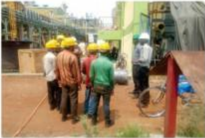
Safety Induction at HPL - Haldia