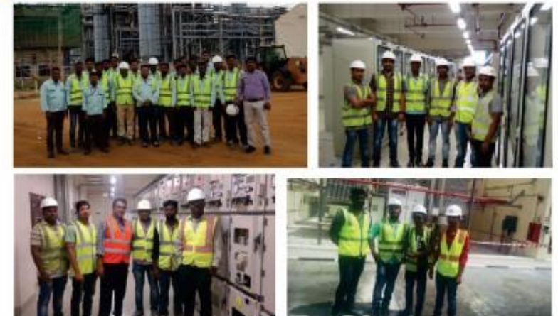
Group photos of engineers in various international sites