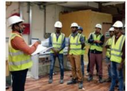
132/11kV Wakrah Logstlc-2 substation